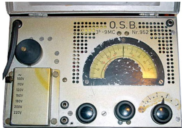
Front panel of a second OSB type II (s/n 952) that survived.