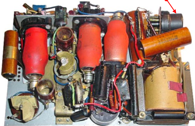
Internal view of OSB type II s/n 905 (using a 6H6 rectifier valve above) and that of s/n 952 (below). Note a selenium rectifier in s/n 952.