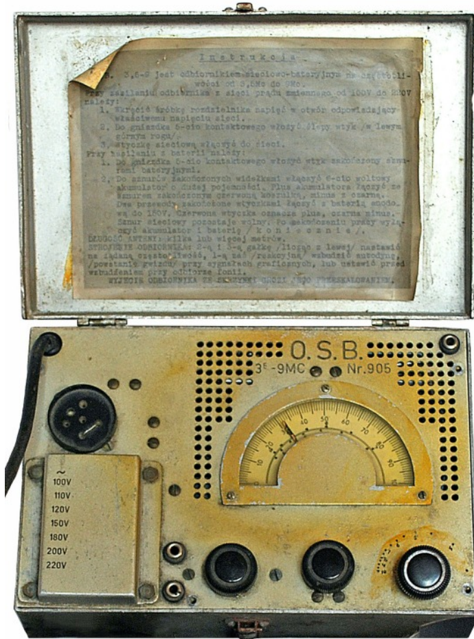
OSB type II (Armia Krajowa #3) Country of origin: Poland

Corrections to the OSB section in the 'Poland' chapter of WftW Volume 4: - The circuit diagram is that of the OSB type I. - In the photo is an OSB type II.